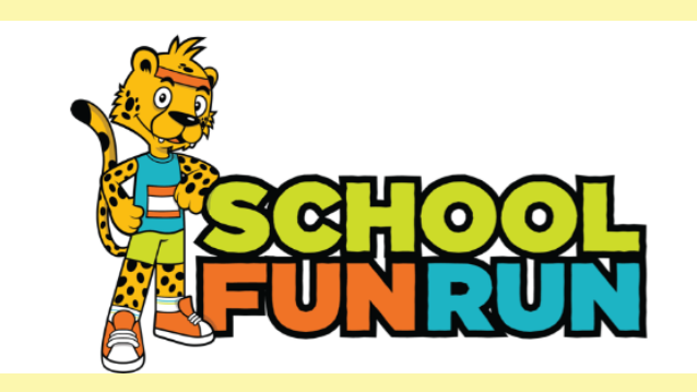
Dear St. Damian families,

Our School Fun Run is coming up in just two weeks! Thank you so much for your support so far. We have already raised over $8,000 toward our goal of $15,000. It's not too late to create a profile or start fundraising. Just jump on funrun.com.au to get started.