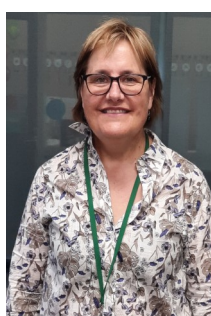
Mary O'Leary Music